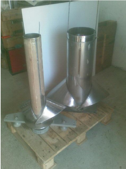
Figur 1 Forming tube for. Hassia-Redatron bagger with hot air vertical sealing